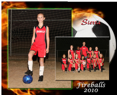
Memory Mate, matched to your team's sport and color

903-806-8539 / 903-236-4839 mrSwannPhotography.com