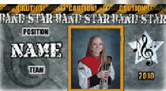
Sports bottle, matched to your sport