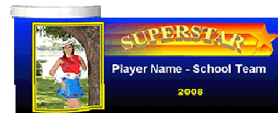
Koozie, beverage holder, matched to your sport