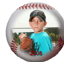
3" Button, matched to your sport